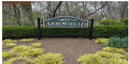
ARROWHEAD – A NICE PLACE TO LIVE

The Arrowhead Rules and Regulations require ALL pets outside of a house to be on a lease and not roaming free. This includes cats, as well as, dogs. Please comply.