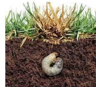
Grub worm in soil