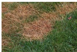
Patches of brown grass