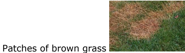
Patches of brown grass