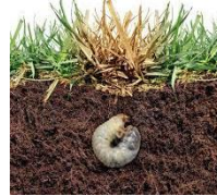
Grub worm in soil